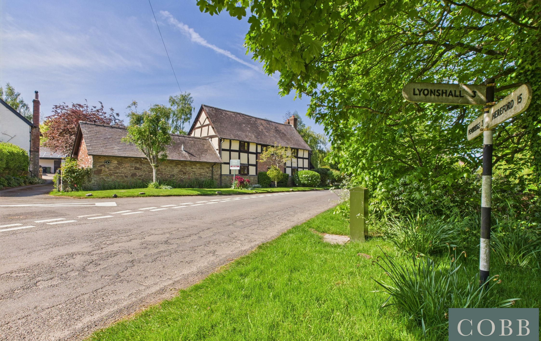
Little Barn, Broxwood, HR6 9JH Price £499,950